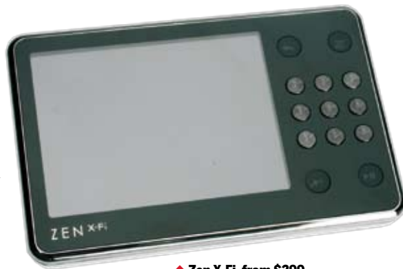
▲ Zen X-Fi, from $299.

There are, however, three distinct problems. First is the elaborate control system — the nine buttons on the face are unnecessary and do nothing to attract people wanting simplicity in design. The headphones are also below par, something Apple still dominates, and while it supports a lot of formats it does not support as many as other Creative players.